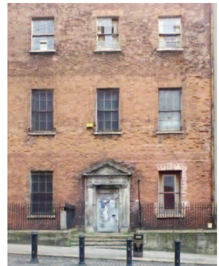
House on Henrietta Street today