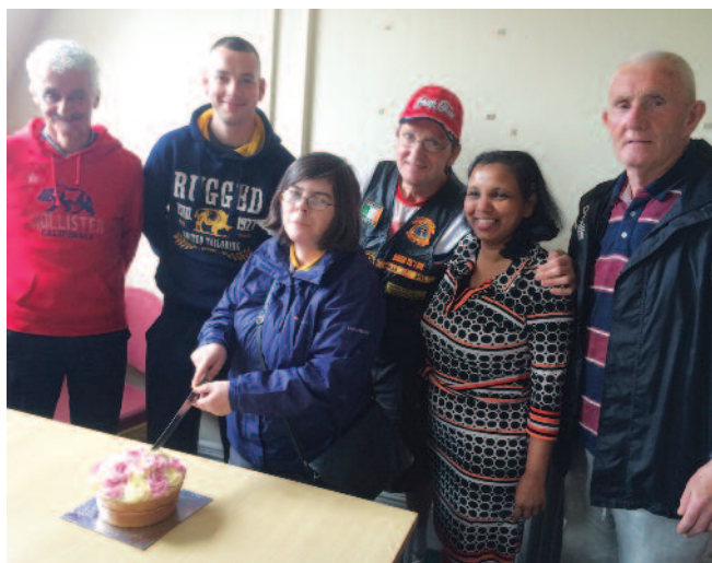
Members of SIAG celebrating the 11 years since the first meeting

Welcome to our new edition of Simon Voices, the newsletter put together by this Group. Simon Involvement and Action group has been meeting for eleven years. We meet once a month in Dublin and our members come from Simon Communities from around the country.