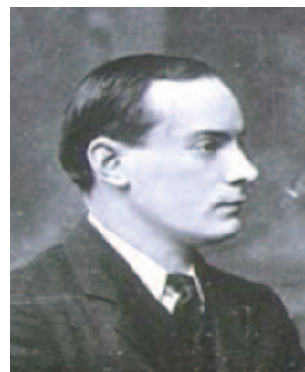
Pádraic Mac Piarais (1879–1916)

I am Ireland: I am older than the old woman* of Beare. Great my glory: I who bore Cuchulainn, the brave. Great my shame: My own children who sold their mother. Great my pain: My irreconcilable enemy who harasses me continually... Great my sorrow That crowd, in whom I placed my trust, died. I am Ireland: I am lonelier than the old woman* of Beare.