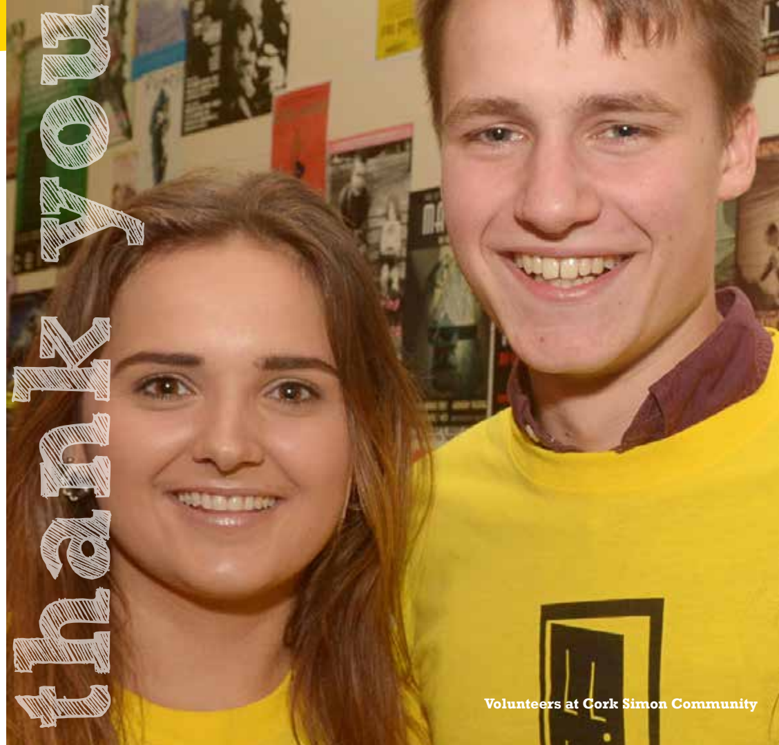
Volunteers at Cork Simon Community

The Simon Communities of Ireland work with a number of corporate partners and there are many ways your company can help and get involved. You can contact us on (01) 671 1606 to discuss tailoring projects and initiatives to match your company's interests and objectives.