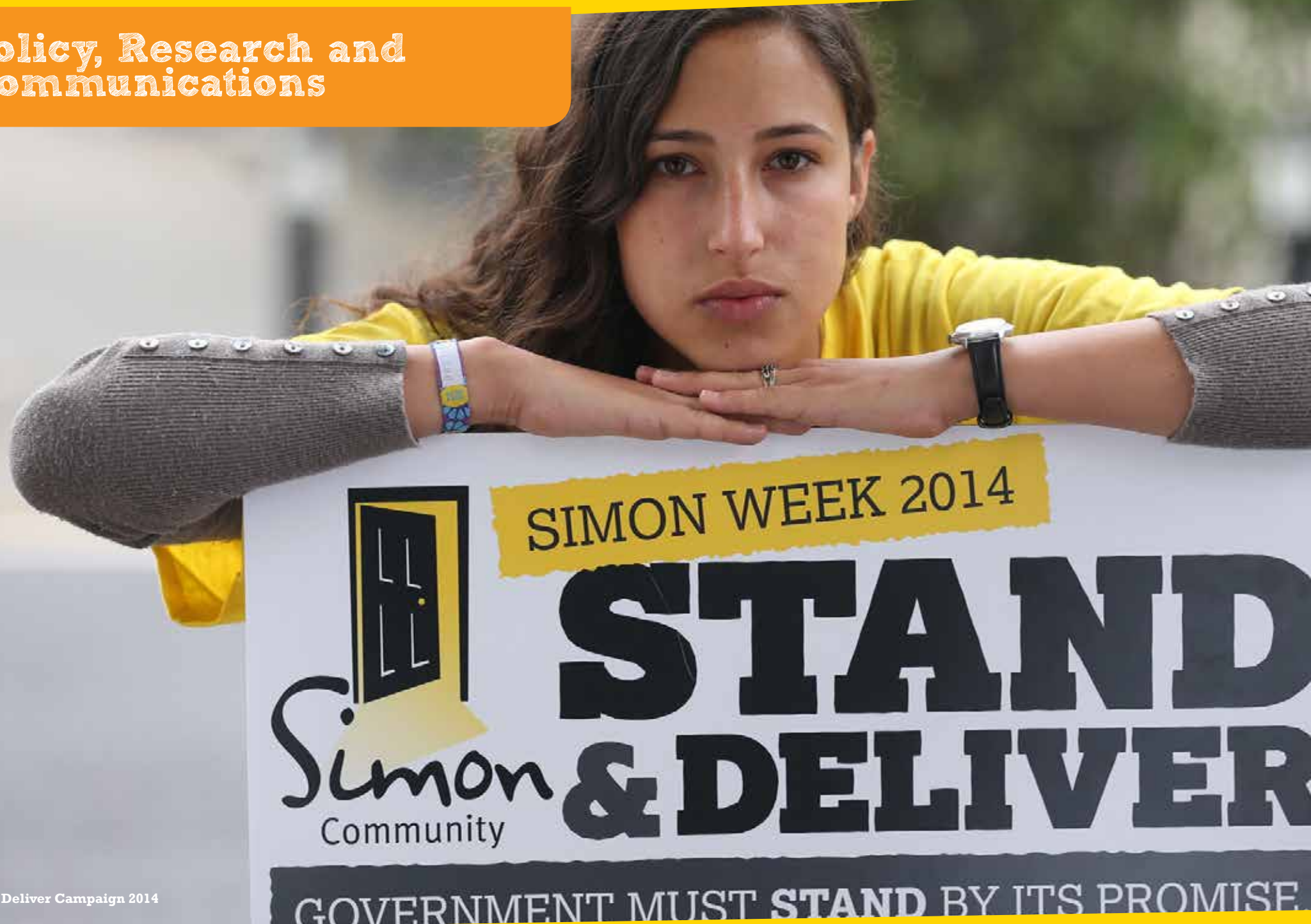
Stand and Deliver Campaign 2014