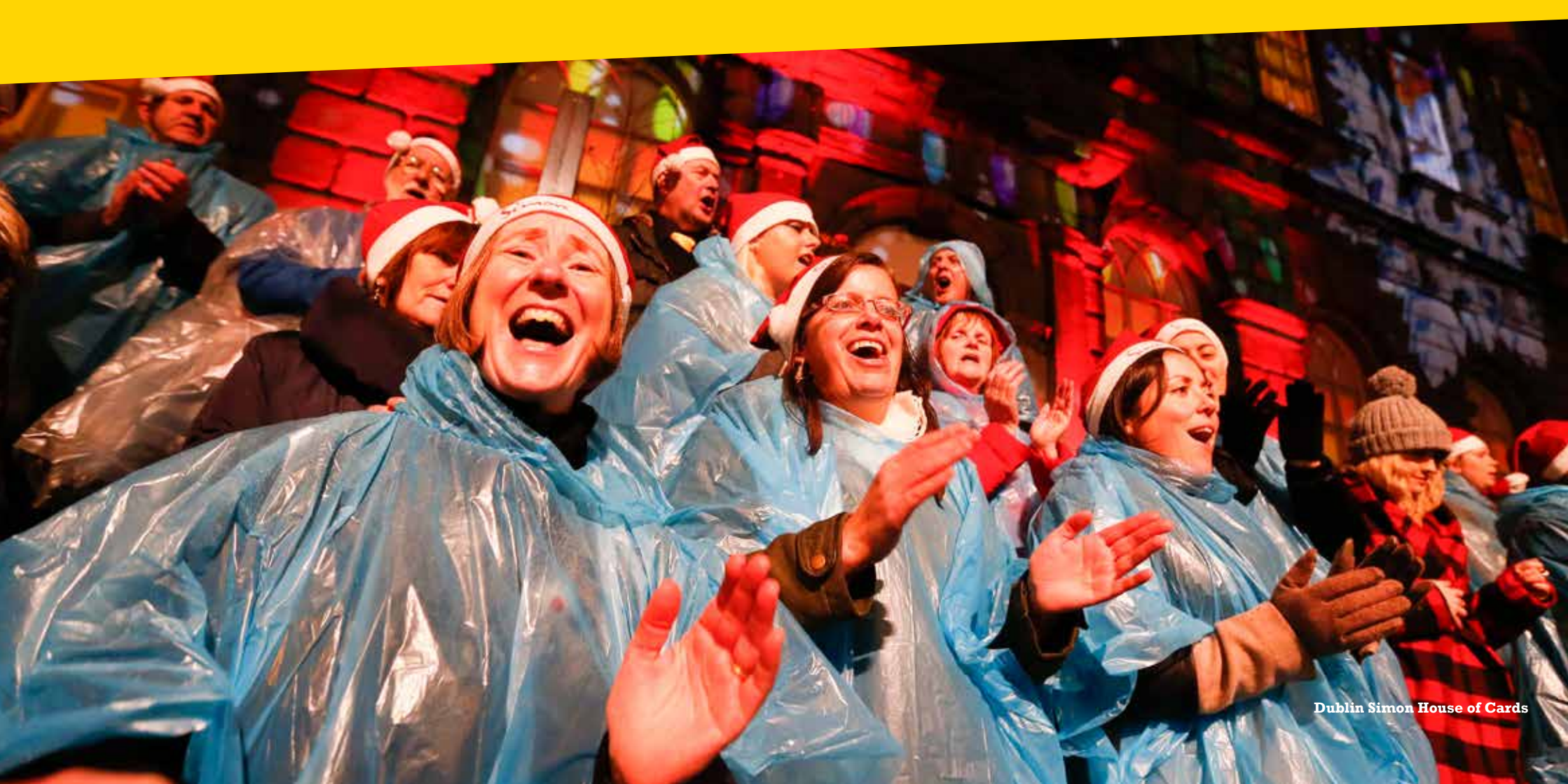
Dublin Simon House of Cards