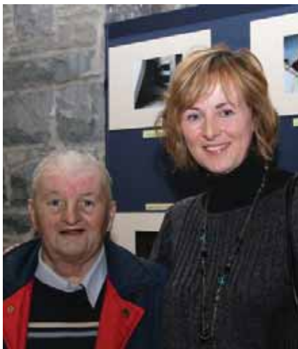
Launch of the Dundalk Simon Photography Exhibition

Dundalk Simon Community offers a range of options to people who are experiencing homelessness. Operating a 'continuum of care' approach which aims to meet the rights and needs of all service users accessing all parts of the service. The range of services begins with outreach prevention which is supported by emergency accommodation, a day centre, a settlement service, supported housing and move on independent accommodation.