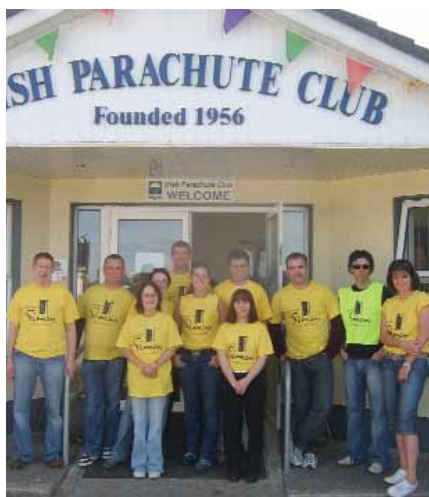
Every penny counts 2008 and parachute jump 2008

South East Simon Community works to prevent homelessness occurring and to address homelessness in Counties Carlow, Kilkenny, South Tipperary, Waterford and Wexford. Our services directly respond to the identified needs on the ground in our region and sit within the framework of government policy. South East Simon works in partnership with our service users to prevent homelessness occurring in the first instance and where homelessness has occurred to assist the people to move out of homelessness and into a home of their own as quickly as possible. We do this in partnership with our national office, our volunteers and other agencies across the region. Mostly we do this in partnership with the public whose generosity makes our work possible.