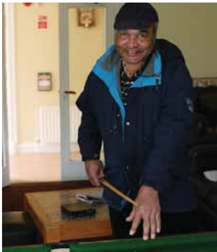
Cork Simon Resident

Cork Simon Community works in solidarity with men and women who are homeless, offering housing and support in their journey back to independent or supported living. Every night Cork Simon provides accommodation for almost 120 people.