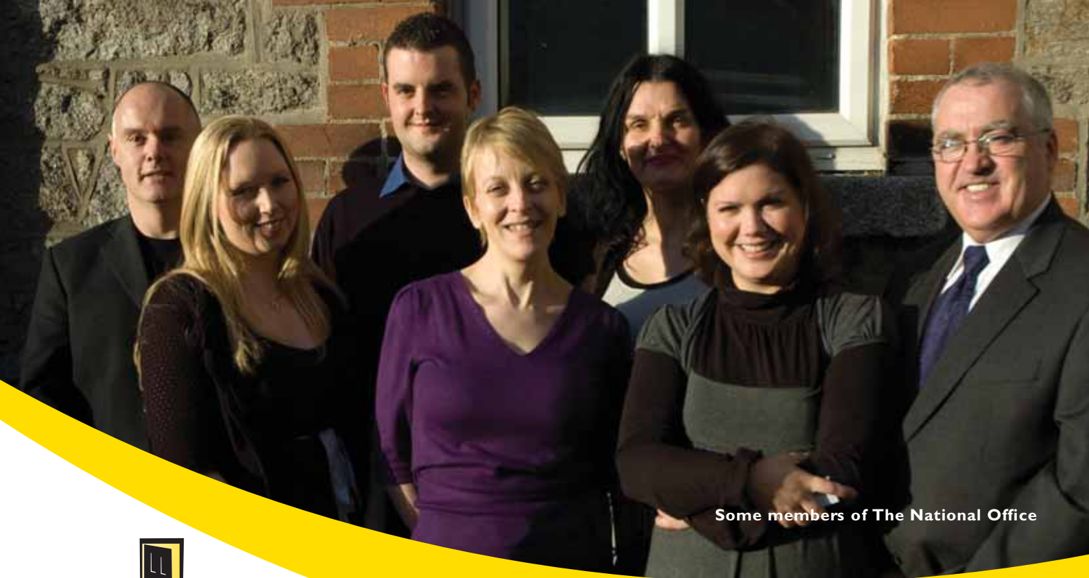
Some members of The National Office