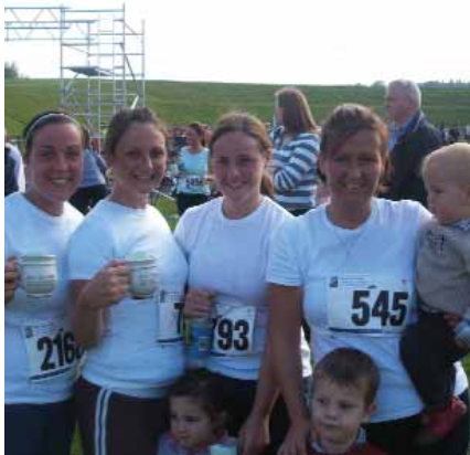
Fundraising for the Mid West Simon Community

Mid West Simon Community launched in May 2007. We operate in counties Clare, Limerick and North Tipperary and have been actively establishing ourselves in 2007. We are a Housing Association registered with the DOEHLG and our 'START' – Tenancy Sustainment programme in Limerick City provides permanent accommodation with tenancy supports. We currently have 7 apartments and one 3 bed house and a further 8 units are being planned for the future.