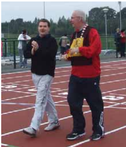
Simon Run in aid of Midlands Simon Community

Since September 2005 Midlands Simon Community has been supporting individuals, couples and families in the counties of Laois, Longford, Offaly and Westmeath who are at risk of, or who are experiencing homelessness, to move out of homelessness and into a permanent home of their own.